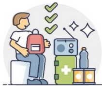
BUILD A KIT